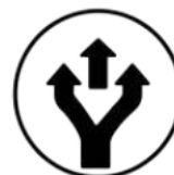
Überholen rechts & links overtaking right & left